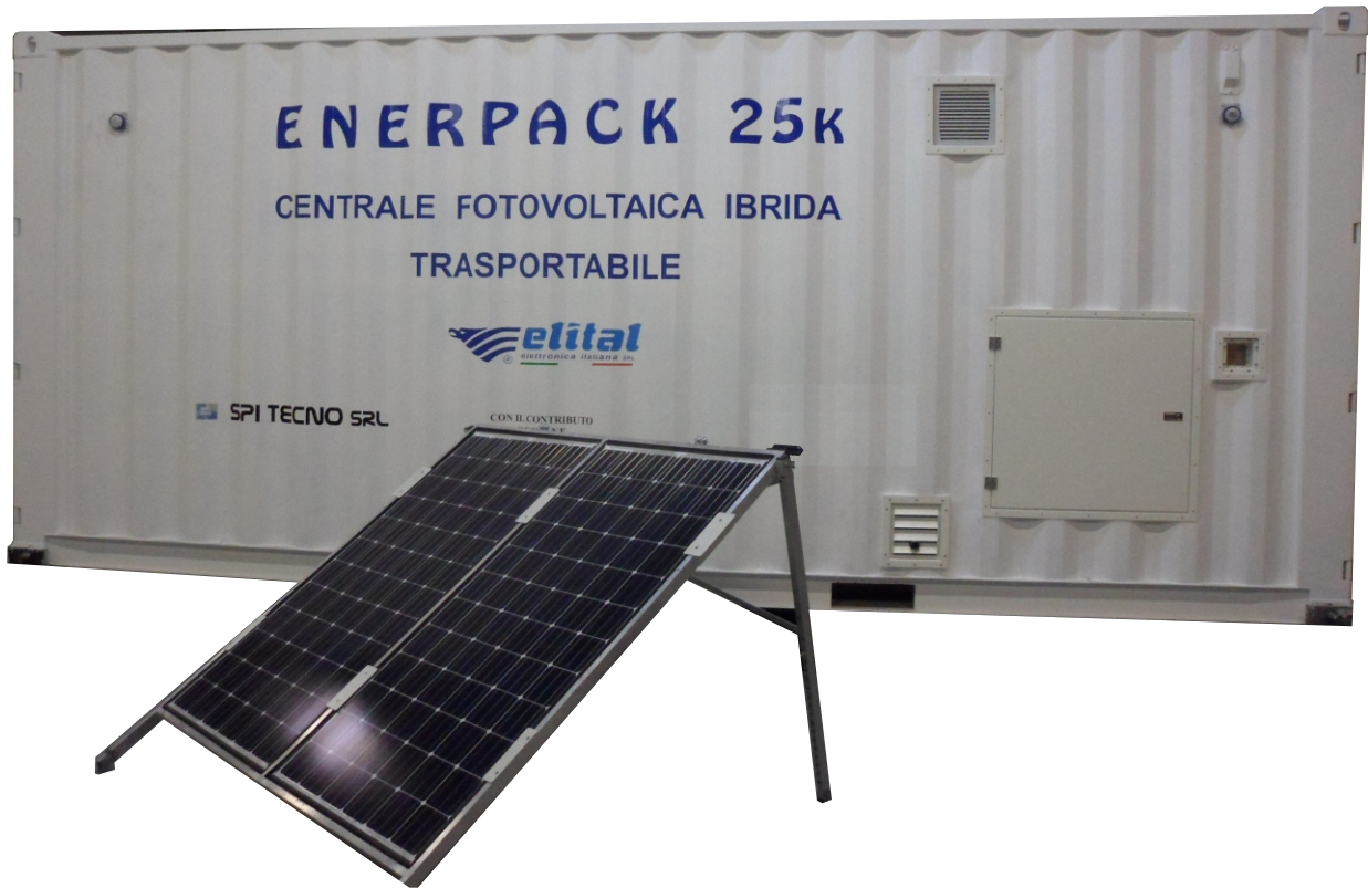
Mobile Hospital ONG