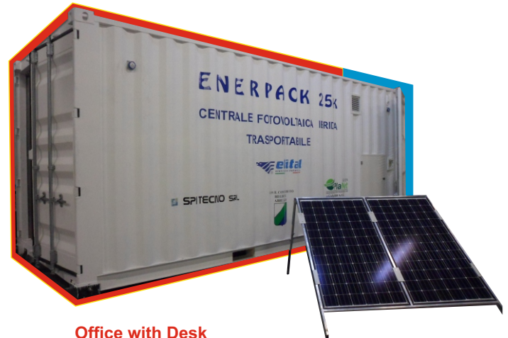
Office with Desk