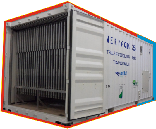
Panel Storage Compartment